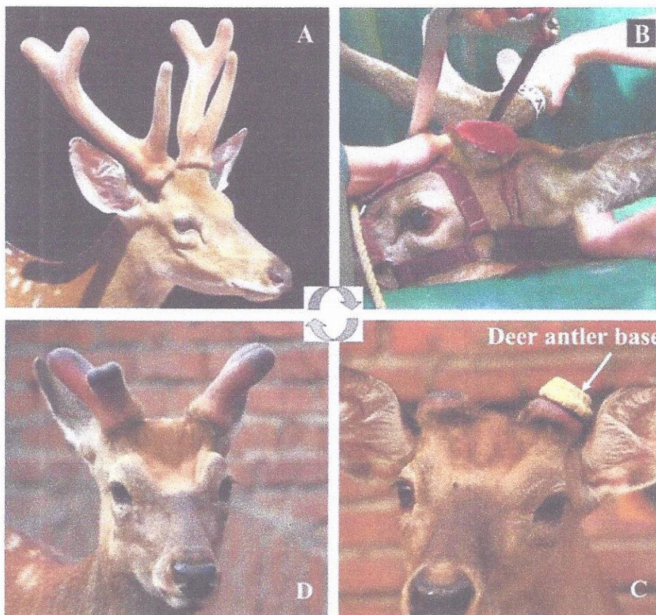
Fig. 2. The cycle of sika deer ( Cervus nippon Temminck) velvet antler production: (A) velvet antler; (B) sawing off the velvet antler; (C) deer antler base and (D) new velvet antler.